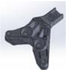
ANTI VIBRATION ENGINE HOUSING AND SUPPORT