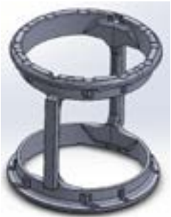
ANTI VIBRATION SUSPENSION